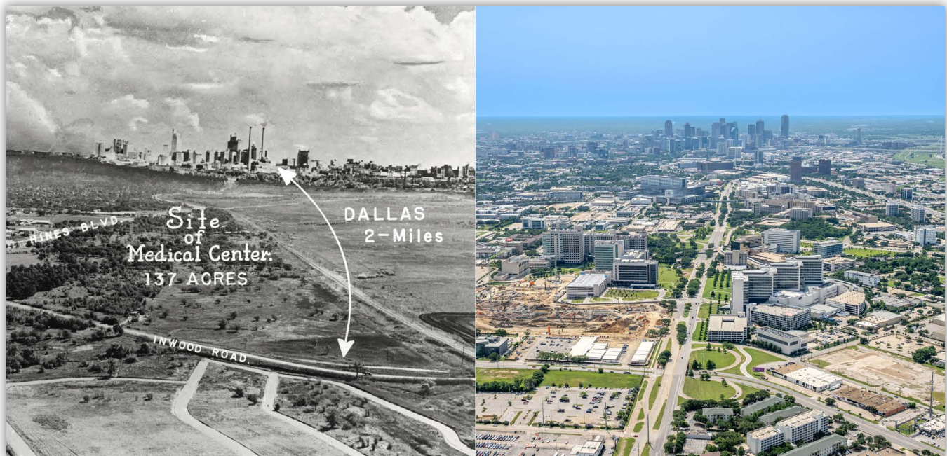
Left: The Hoblitzelle Foundation donated funds to Southwestern Medical Foundation to purchase 62 acres, doubling the size of the medical campus, 1945. Right: Aerial view of UT Southwestern Medical Center, 2025.

As North Texas has grown, philanthropic investment has helped shape a leading medical community and support the people and institutions at its center. The progress visible today is a powerful reminder that lasting change is built over time through vision, consistency, and belief in what North Texas can become.